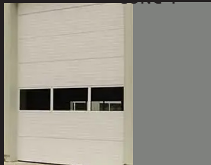
Wayne Dalton Sectional Doors