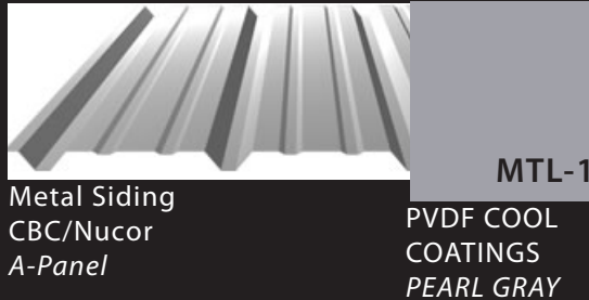
Metal Siding CBC/Nucor A-Panel