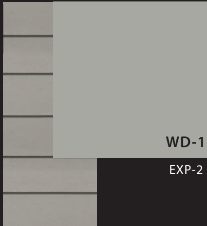
James Hardie Hardie Plank, 3" reveal