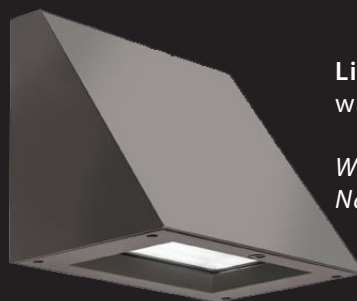
L1 + L2 Lithonia wall wash WDGE2 Natural Aluminum